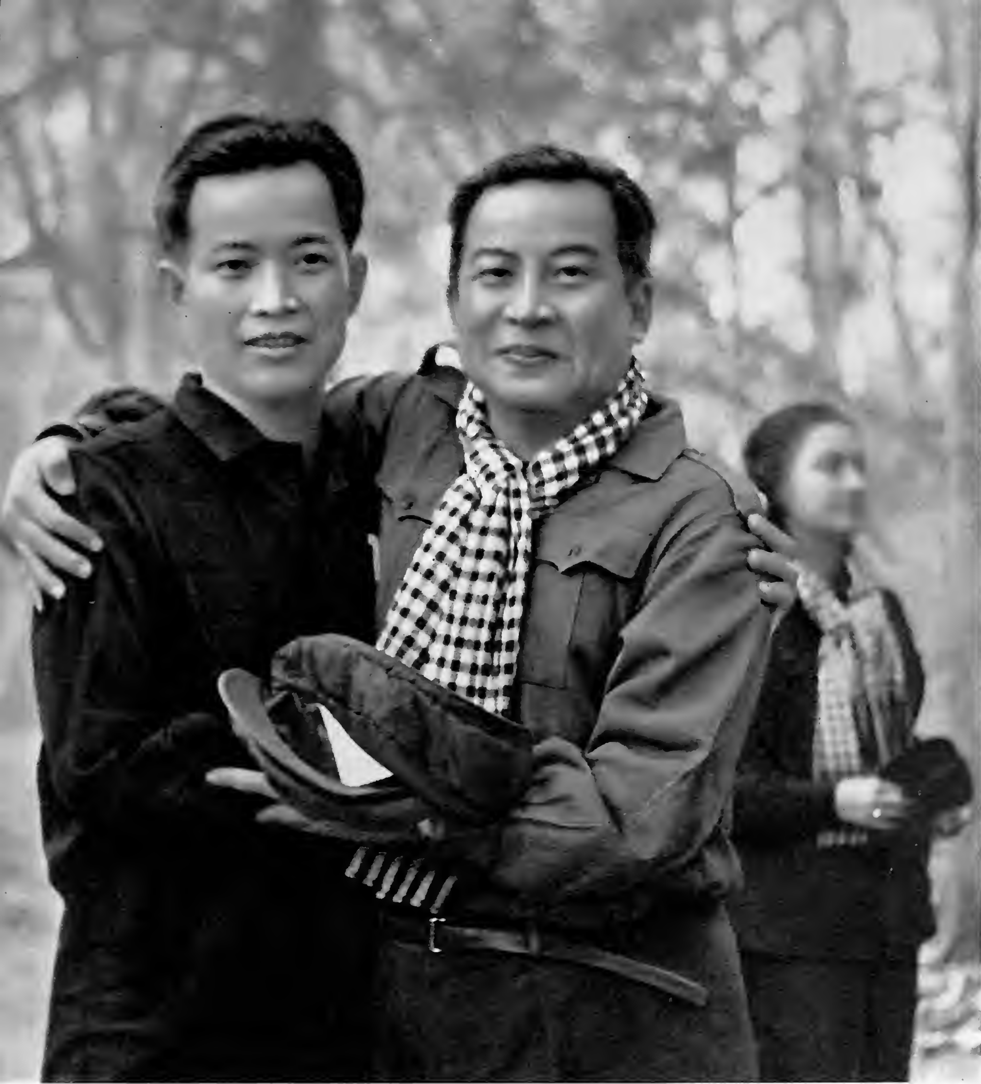
A reunion in the forest of Stung Treng Province between Samdech Sihanouk and Khieu Samphan, Deputy Prime Minister and Commander-in-Chief of the People's Armed Forces of National Liberation. Behind them is Madame Sihanouk.